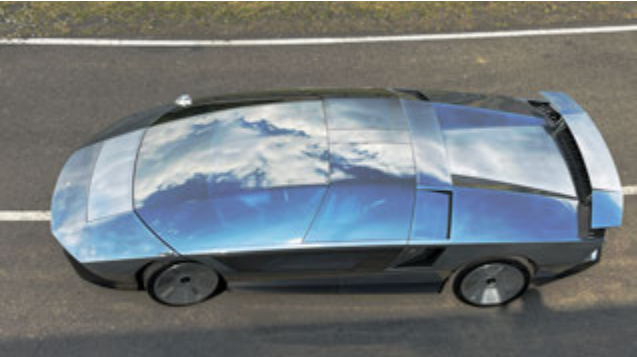
"There are dozens of sports cars" - continues Fabrizio - "that have become iconic that took their cues from those shapes, it was pure avant-garde. For me it is one of Giorgetto's most incredible and successful stylistic exercises."